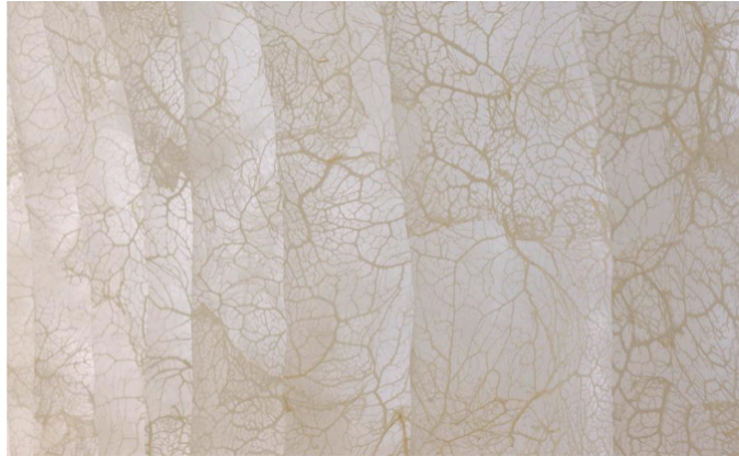
The first installation to use animal viscera inhabits two rooms of the gallery. Fragility (2016), pictured, was first installed at Fabrica, a decommissioned Regency church in Brighton

Walker is keen to point out that all animal-based materials used in the exhibition have been carefully and responsibly sourced, and around 80 per cent of the products would have just been thrown away had they not been salvaged by Hadzi-Vasileva. This chimes with the artist's penchant for using materials of little financial or personal value; transforming them into something ethereal, and in this case, scientifically progressive.