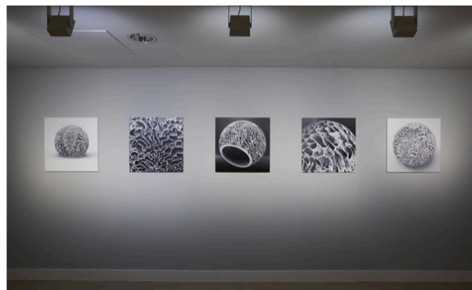
A photomontage of medical images Hadzi-Vasileva collected during the research process opens the show, which prepares visitors for a candid video installation of individuals frankly discussing their experiences with digestive diseases. Pictured: installation view