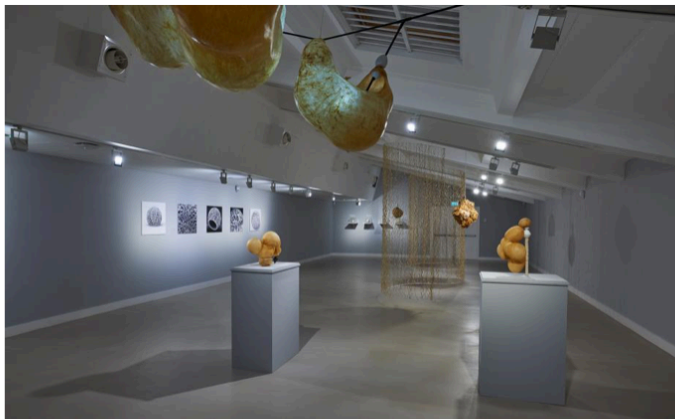
The artist's penchant for using materials of little financial or personal value; transforming them into something ethereal, and in this case, scientifically progressive. Pictured: installation view