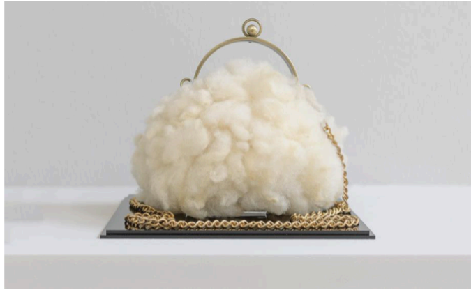
The artist teamed up with scientists and medical professors to draw a wider public awareness to digestive diseases and the stigma surrounding them. Pictured: Ladies Purse 4 , 2016