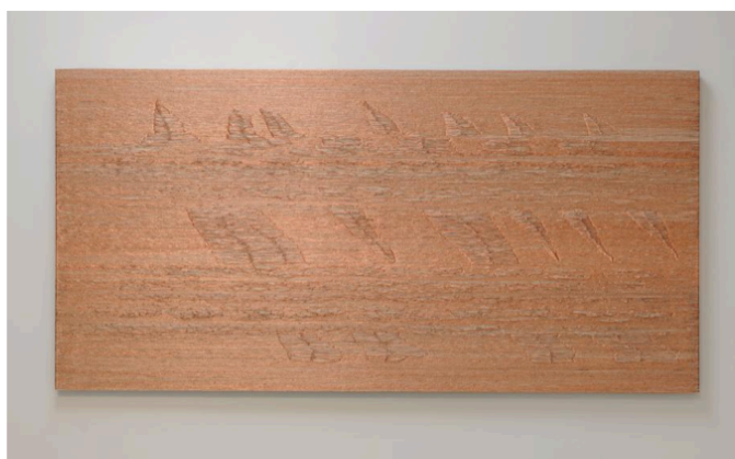
Curator Neil Walker is keen to point out that around 80 per cent of the materials used in the exhibition would have just been thrown away had they not been salvaged by Hadzi-Vasileva. Pictured: Copper Wire Drawing , 2016, which traces the lines of a Manometry machine, which records the mobility of the digestive system