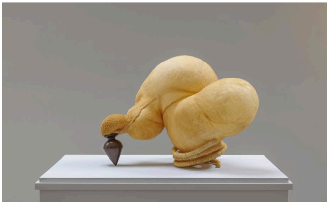
Sometimes harrowing, sometimes witty and always gracefully rendered, Hadzi-Vasileva's work is a way of breaking down the final taboo of the body. Pictured: installation view