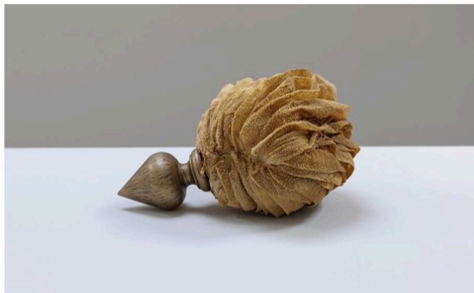
Hadzi-Vasileva uses and experiments with unconventional materials made from animal innards such as caul fat. Pictured: installation view