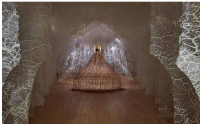
Fragility has been combined with one of Hadzi-Vasileva's other renowned sculptures, Haruspex , first shown at the 56th Venice Biennial, 2015