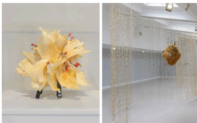
A six-month residency at Michelin starred London restaurant Pied à Terre, produced some of the artist's more light-hearted work. Gill's Slit's (pictured left) is a sculpture made from skate bones that the artist salvaged from the restaurant bins. Pictured right: installation view